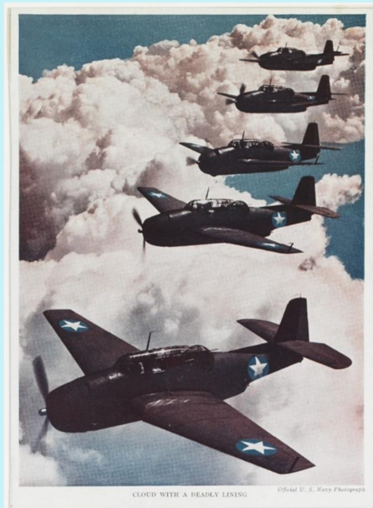
CLOUD WITH A DEADLY LINING